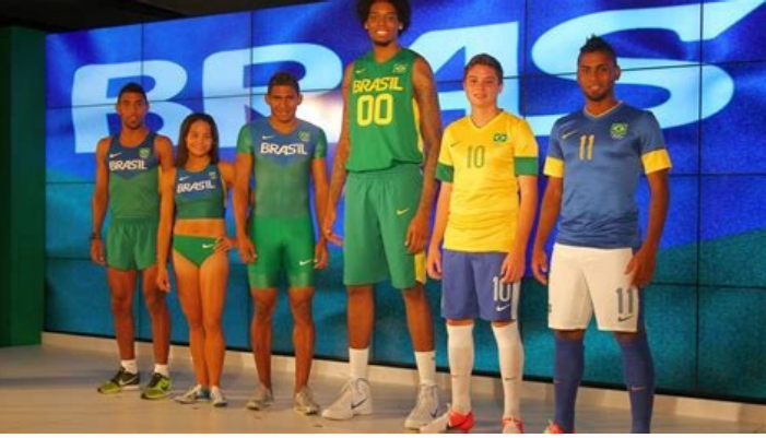
Brazil football uniform cabal. Brazil national football team uniform.