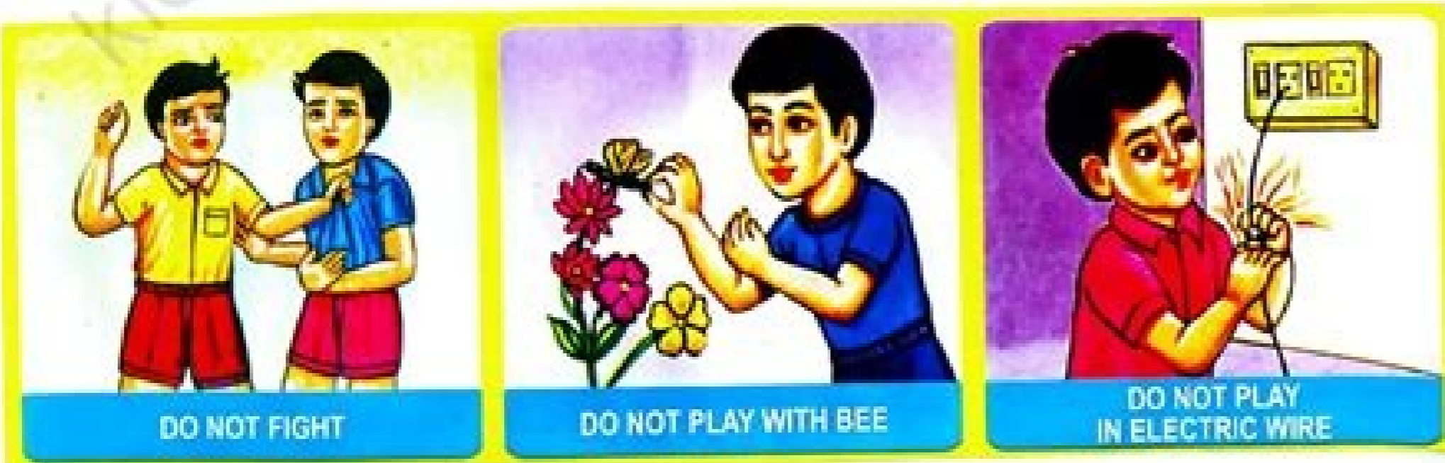
DO NOT FIGHT