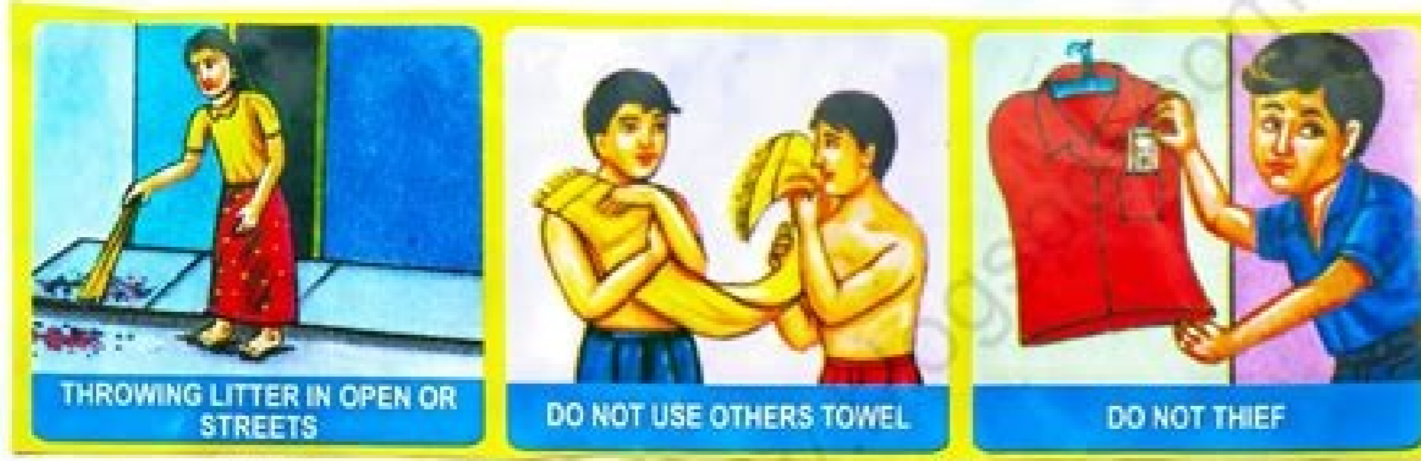
THROWING LITTER IN OPEN OR STREETS